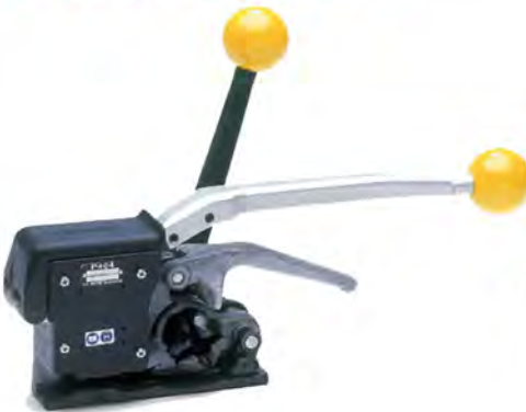
P403/404 Manual plastic strapping tool for PET & PP strap 13-16mm. Use with serrated metal seals