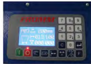
Easy to operate control panel