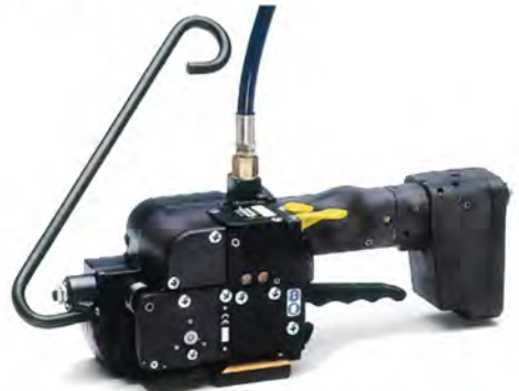
P356 Pneumatic strapping tool for PET strapping 16-19mm