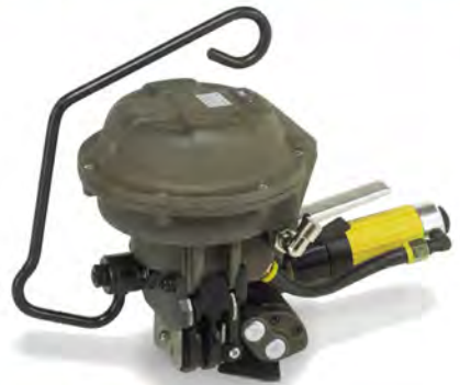
A482/A480 Pneumatic pusher type combination steel strapping tool