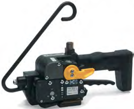
P355 Pneumatic strapping tool for PET and PP strap 10-16mm