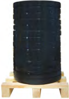
Regular Duty, Painted & Waxed