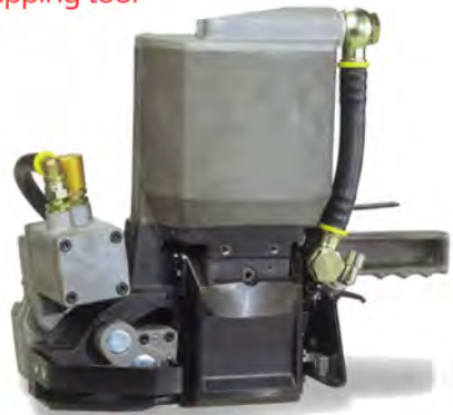
A383/A380 Pneumatic sealless combination steel strapping tool