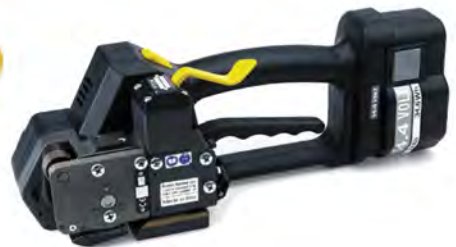
P326/P318 Battery powered plastic strapping tools – the new generation