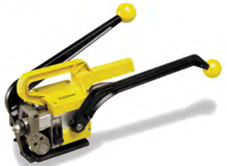
A334/A337 Manual Sealless steel strapping tool 19mm