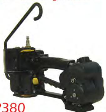
P380 Pneumatic plastic strapping tool for round or small surface applications