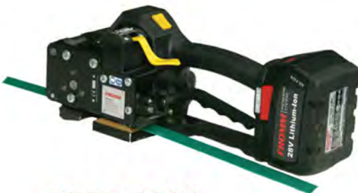
P327/P330 Battery powered plastic strapping tools for heavy strapping