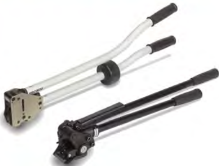
A402/A412 Manual pusher type steel strapping tool