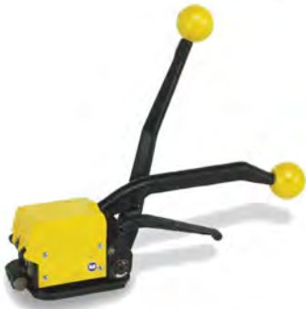
A333 Manual Sealless steel strapping tool