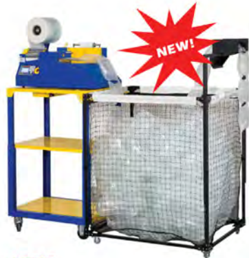
AP250 New and compact AIRPAD table top machine