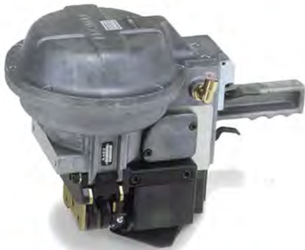
A483/A480 Pneumatic pusher type combination steel strapping tool